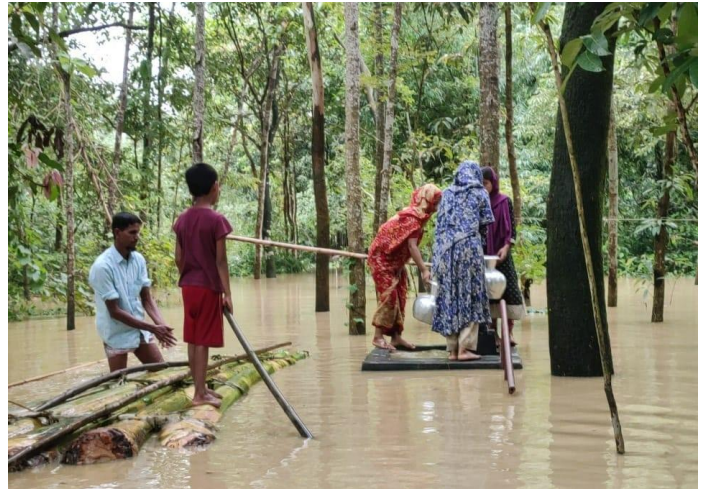
UNICEF supported flood resilient water point constructed during 2022 flood response at Kanaighat Upazilla, Sylhet. June 2024, the flood affected people collecting water from this water point.