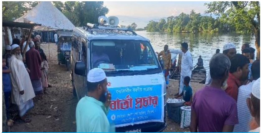
District Information Office in Sylhet disseminating the lifesaving information and messages to the flood affected people.