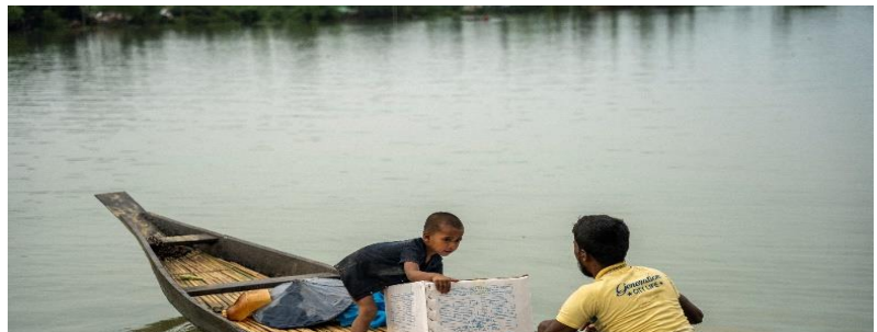
On 20 June 2024, in collaboration with the Government of Bangladesh and local stakeholders, UNICEF is distributing jerry cans, water purification tablets, and hygiene kits to meet the immediate needs of flood-affected children and families, ensuring their safety and well-being.