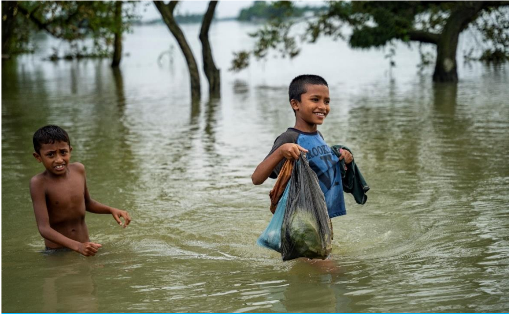
Two children wading through water in Sylhet where over 2,000,000 people, including over 772,000 children, are affected by the devastating floods in north-eastern Bangladesh.. UNICEF is working with the Government of Bangladesh and local stakeholders to distribute safe water and emergency supplies to the affected communities.